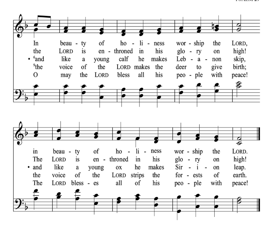
St. 1, The Psalter , 1912; alt. St. 2–5, Book of Psalms , 1871; alt.; rev. 2004

WILLOW GROVE 12.11.12.11.11. Ronald Alan Matthews, 1985 Tune © 1990, RAM Music Publications